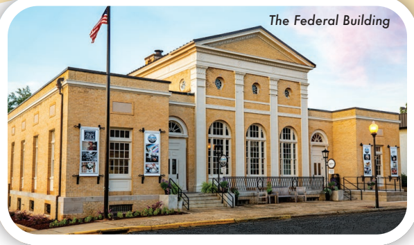
The Federal Building