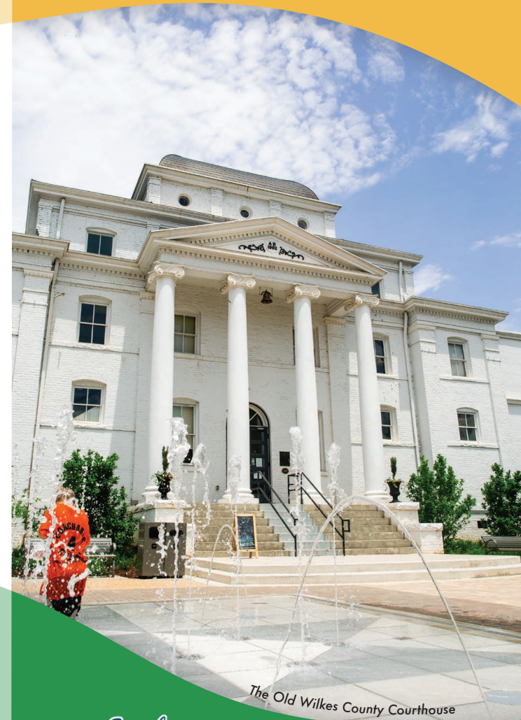
The Old Wilkes County Courthouse